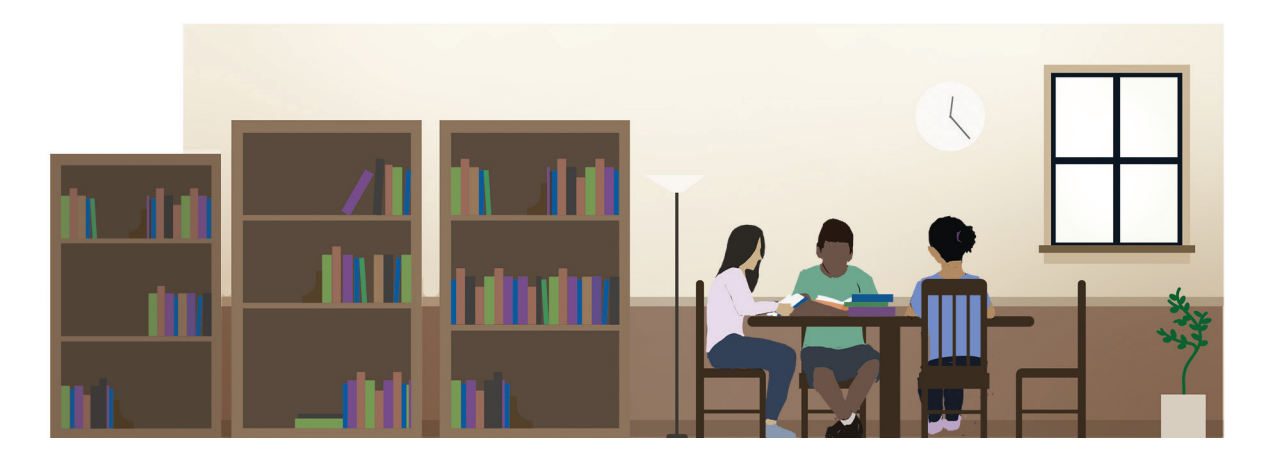
Originally published in the February 27, 2023, issue of the Christian Science Sentinel.

I can't say that I've never felt insecure again. All of us are at times faced with the pressure to conform, and that can sometimes be not so easy to resist. But as we cultivate the practice of looking to God to tell us who we are—for assurance that we are loved and irreplaceable—we find the confidence to be true to ourselves, and we discover the lasting joy of doing so.•